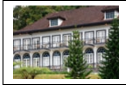
Cameron Highlands Resort