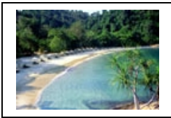
Pangkor Laut Resort Majestic Malacca